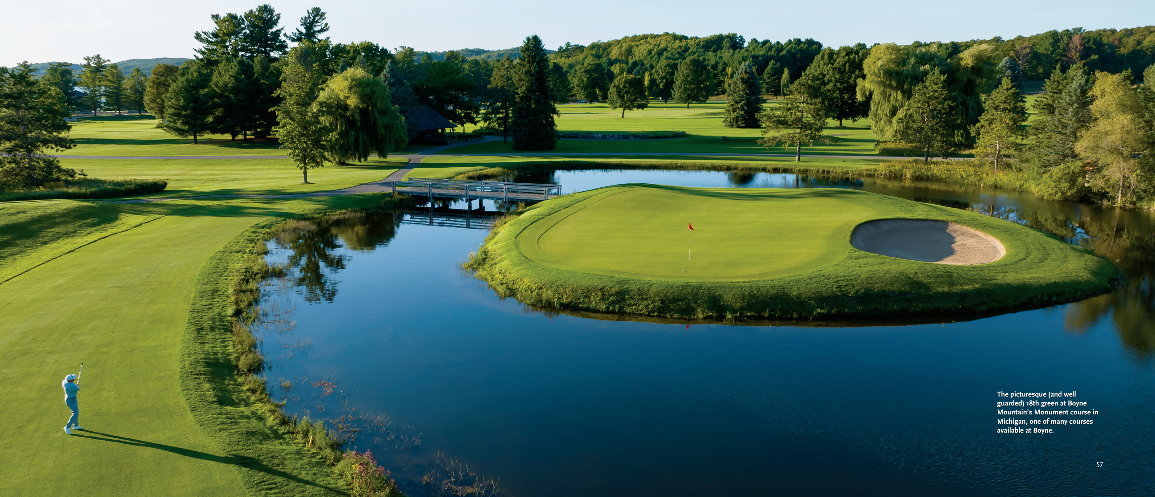
The picturesque (and well guarded) 18th green at Boyne Mountain's Monument course in Michigan, one of many courses available at Boyne.

not as well known, places with standout courses and other impressive amenities that remain largely out of the public eye, destinations that are more overlooked by leisure travelers. These are golf's hidden gems, and they are worth seeking out because they offer plenty of great courses, often at lower prices