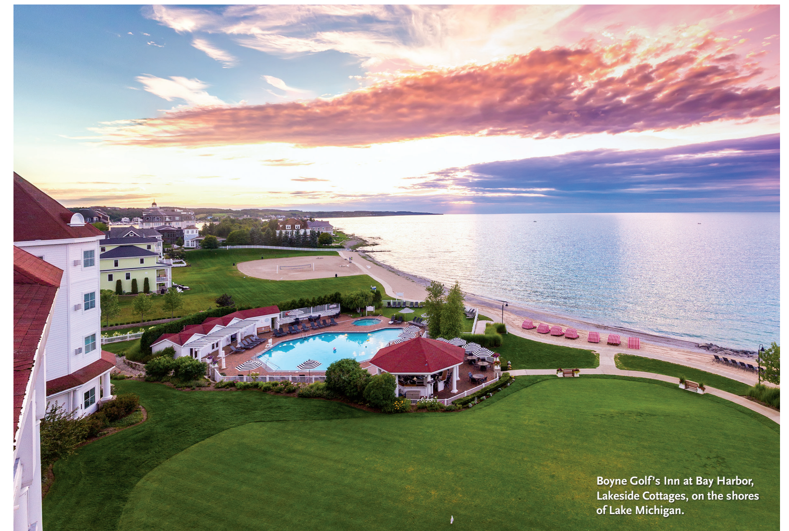
Boyne Golf's Inn at Bay Harbor, Lakeside Cottages, on the shores of Lake Michigan.