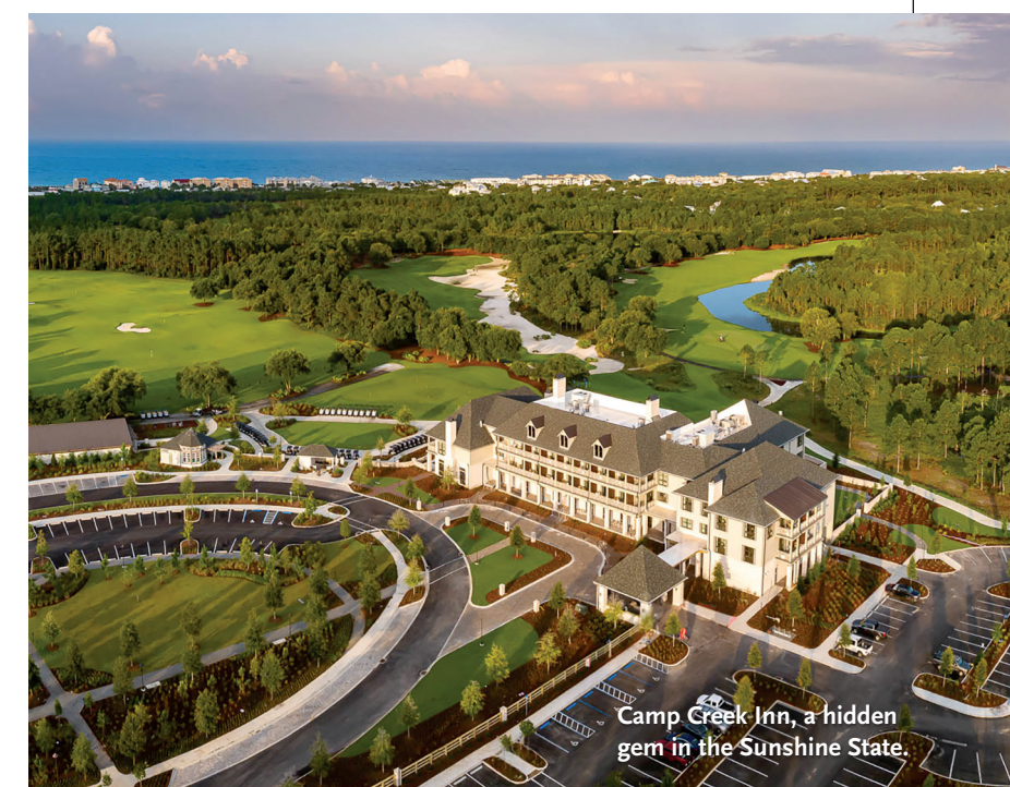
Camp Creek Inn, a hidden gem in the Sunshine State.