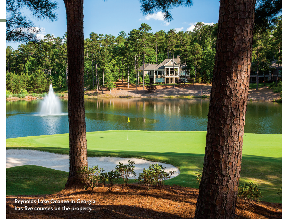
Reynolds Lake Oconee in Georgia has five courses on the property.

Reynolds is a highly-amenitized resort community, with several clubhouses, first-rate cuisine and amazing watersports and fishing. There are sporting clays, archery, falconry, off-road driving, more than 20 miles of nature trails, a huge spa, modern fitness center and seven pools. Throw in the 31 clay, hard and pickleball courts and it is also a top-ranked tennis resort. It offers a wide variety of home and condo rentals, but note that the luxury Ritz-Carlton on property is one of the few in the United States with a club floor and lounge, and the site also has a new hidden speakeasy, but alas it's not cigar friendly. You can buy cigars in the retail shop for smoking on the course or somewhere else outside.