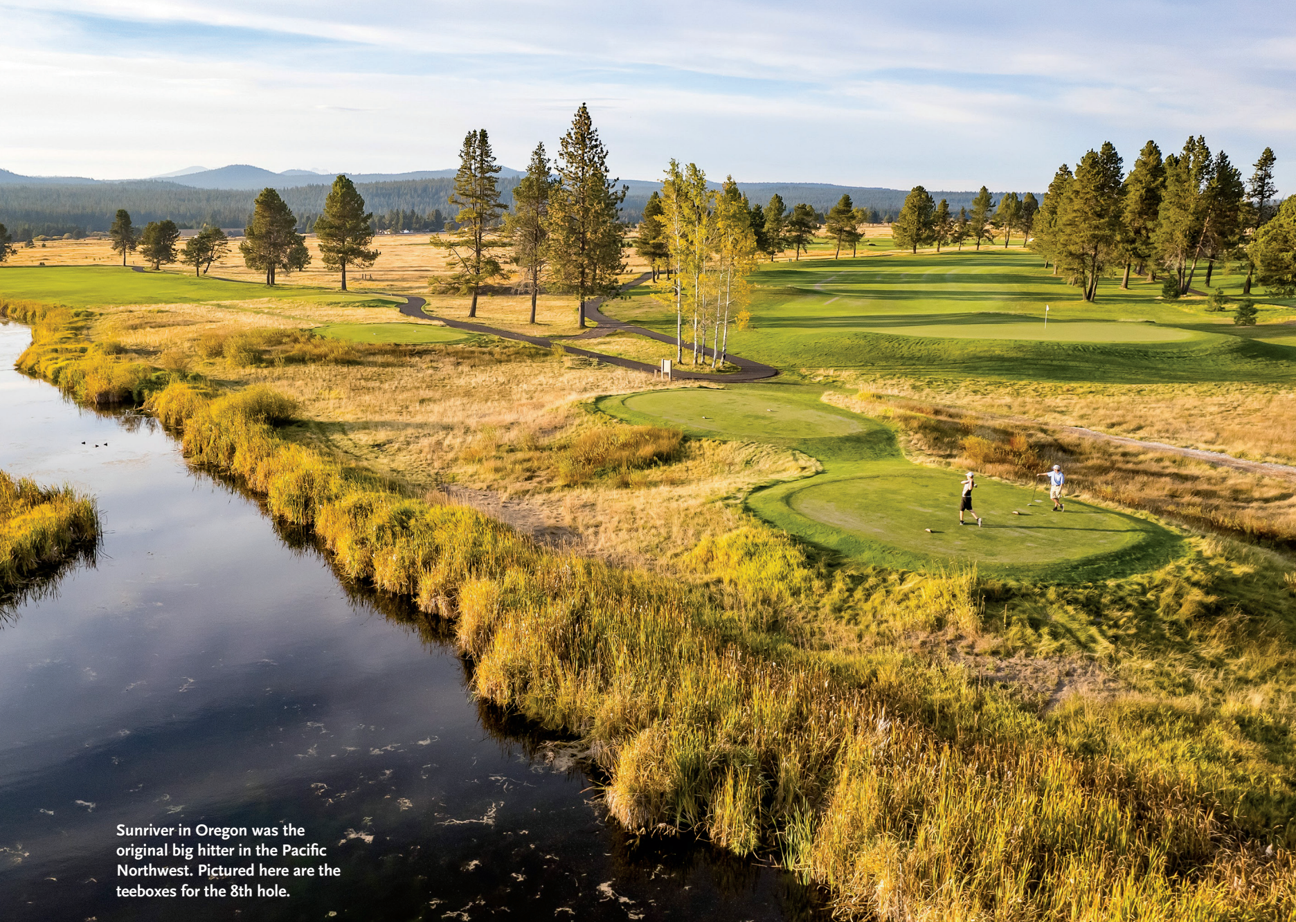
Sunriver in Oregon was the original big hitter in the Pacific Northwest. Pictured here are the teeboxes for the 8th hole.

There are a few other resorts in the Sunshine State with 54 holes or more, but only Streamsong can claim three courses of this overall quality. The Camp Creek course by Tom Fazio is a Top 100, while the Greg Norman-designed Shark's Tooth makes Golf Digest's Best in Florida list. The fittingly named third course, The Third, by Davis Love, just opened this spring and is not yet rated, but Love has proven to be a reliably excellent designer, especially in the Southeast. There is also a high-end modern Golf Performance Center at Camp Creek with all the best in high-tech gear including uncommon GASP Labs Force Plates for 3D movement scanning and a multi-brand club fitting studio.